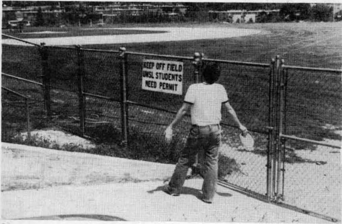
PAY UP, KEEP OUT: Student government is presently considering an administration plan to utilize student activity money to install lights on the baseball field.