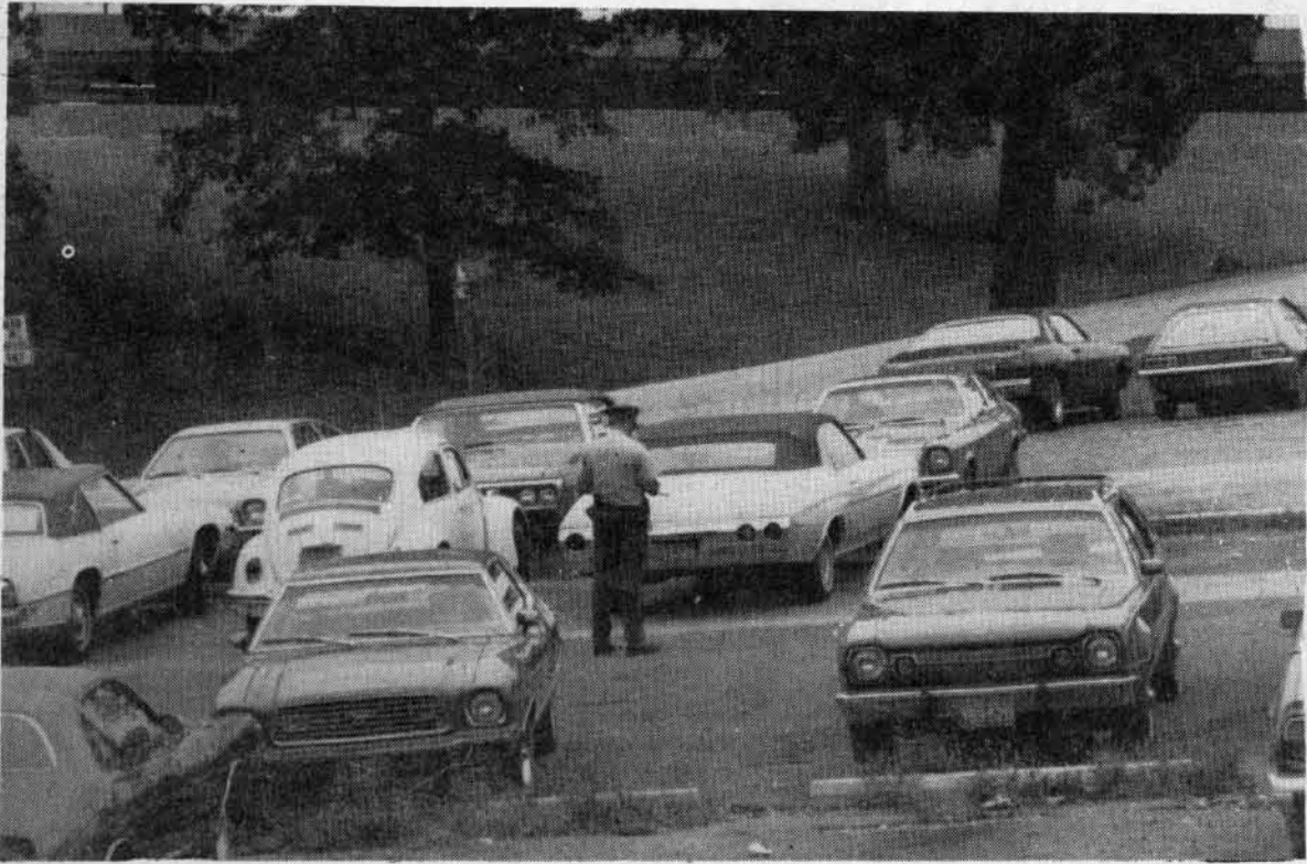
YOU LOSE: During the summer session the sight of UMSL police officers ticketing cars parked without permits is nearly as common as during the rest of the year.